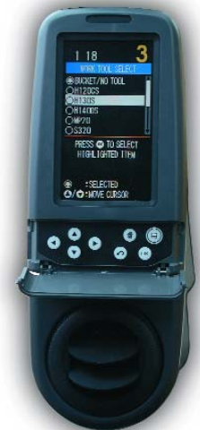
Tool Control System